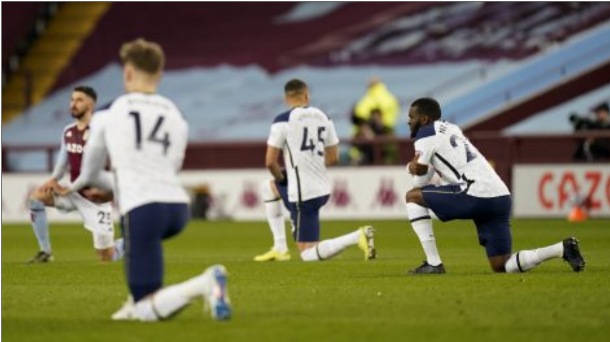
Tottenham Hotspur players take the knee before a Premier League match last season