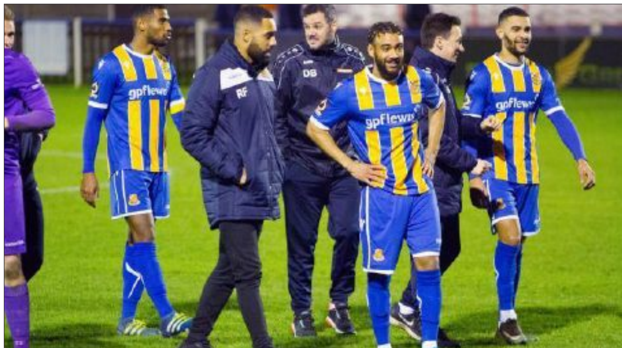
Wealdstone still do not know if they will be promoted from the National League South into the National League