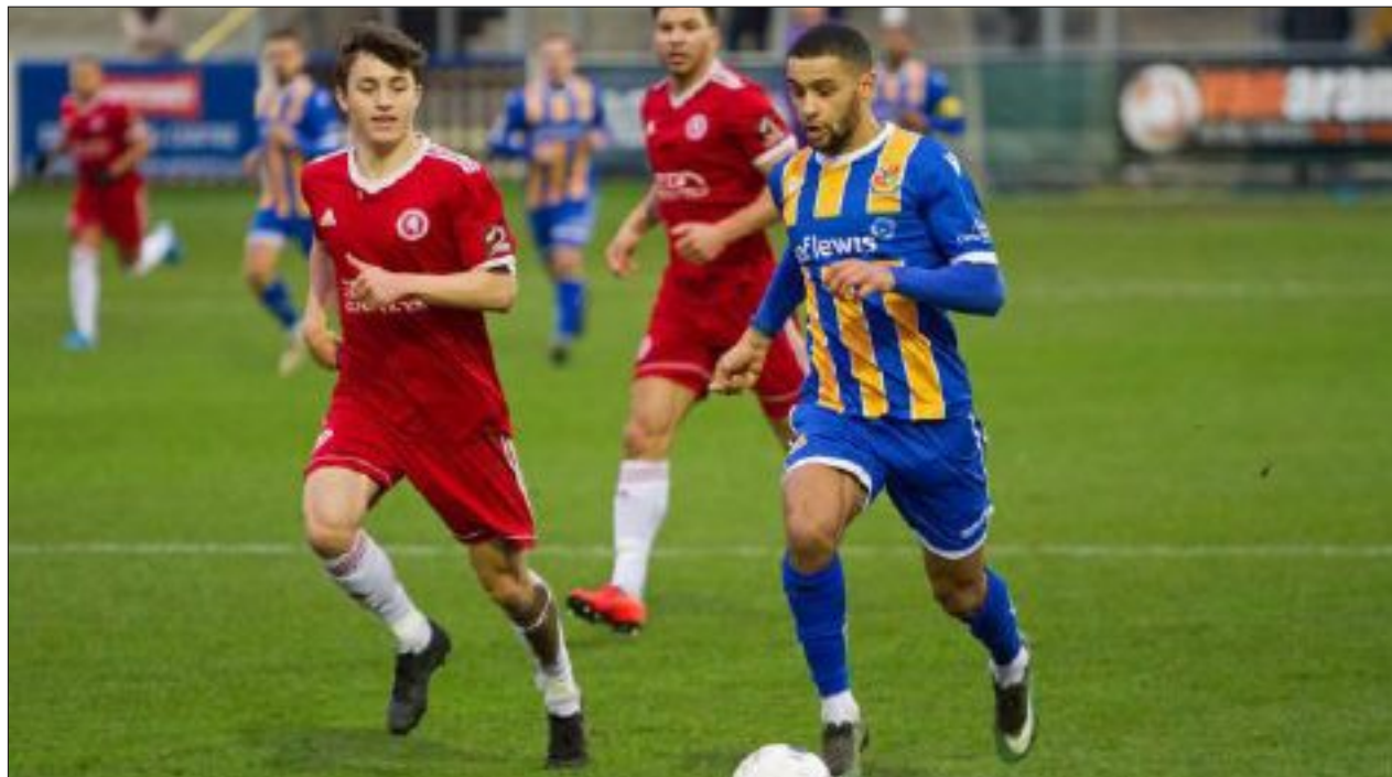
Wealdstone announced their end of season award winners online after their season was ended early by the coronavirus outbreak.