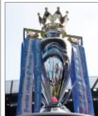
Sport could be back by next month.

SUPPORTERS MAY HAVE TO WAIT FOR A VACCINE