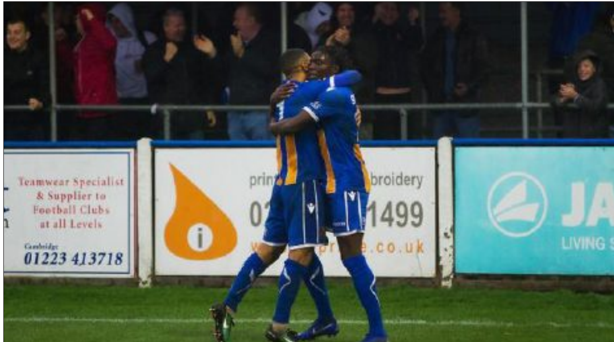
Wealdstone do not yet know if they will be promoted or if they will have to play another season in the National League South