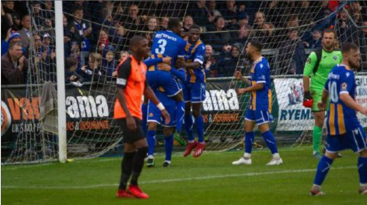
Wealdstone celebrate scoring a goal against Bath before the National League was postponed by the coronavirus outbreak.