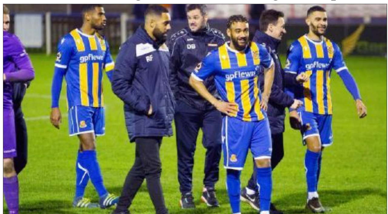
Top of the league Wealdstone are left waiting on a decision from the National League to know the outcome of the current season.