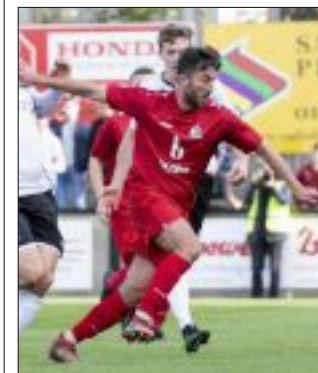
Harrow Borough secured a point against Weston-Super-Mare.