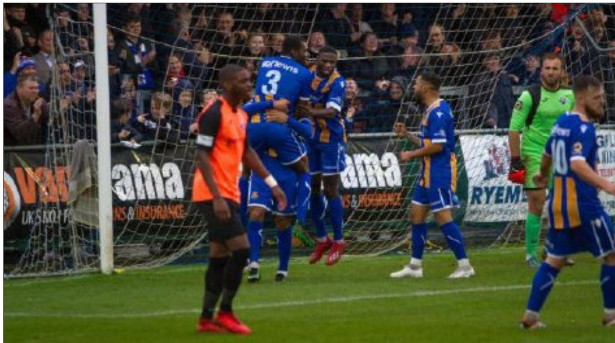
Wealdstone's lead in the National League South table was extended to seven points with a win over Tonbridge Angels on Saturday.