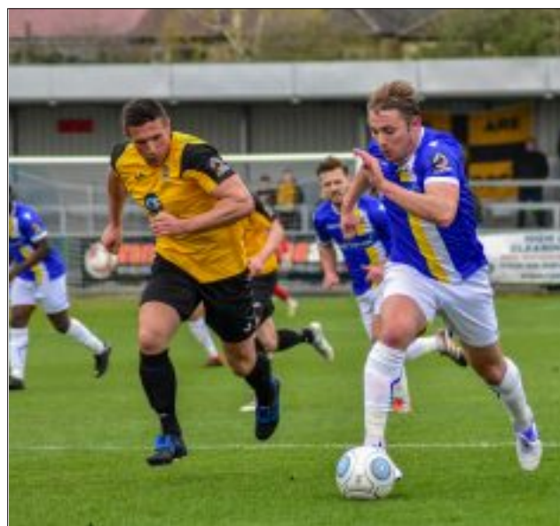
Wealdstone were beaten away at Hampton on Saturday.

Femi Azeez had the best of the chances, but his shot from the edge of the box was saved to leave the Stones a point outside the play-off zone with three matches remaining.