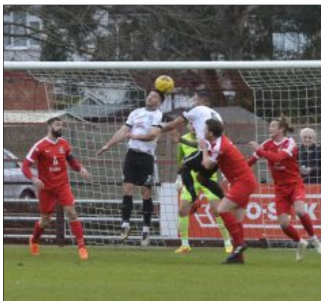
Kings Langley are forced to head clear during their 4-3 victory over Harrow Borough on Saturday.