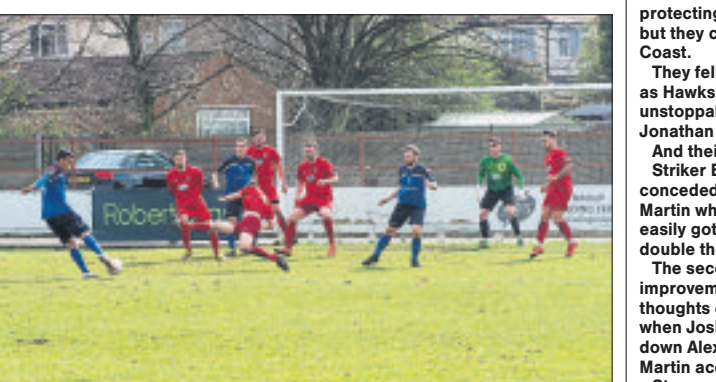
Harrow Borough edged to victory over Wingate & Finchley on Saturday.

He reckons he has only been able to pick the same defence three or four times this season and Bor-ough's incredible injury curse struck again in midweek as their patched-up side fell to a 3-0 defeat at