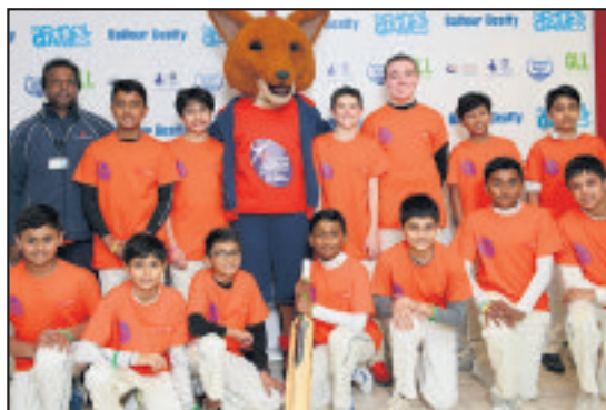
Harrow's team have qualified for the final at Lord's.

To find out more about the competing or volunteering at London Youth Games, log on to londonyouthgames.org.